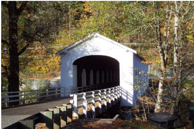
Fig. 1 Goodpasture Covered Bridge

The Goodpasture Covered Bridge is a five-span timber structure crossing the McKenzie River in eastern Lane County, Oregon. The river is one of America's most pristine waterways. It is home to many protected species of aquatic life and is very popular with boaters and anglers. The bridge is a lifeline link providing the only access to a neighborhood of approximately 300 residents. A short approach span from Oregon Highway 126, one of the major east-west state highways, leads to the main span, which is a 50.3 m-long covered Howe truss followed by three simple timber approach spans. The total length is 72.5 m. It is a single-lane bridge that has served to carry logging, recreational, and local traffic. For several years it has been weight-restricted because of structural distress. It still carries approximately 750 vehicles per day, of which approximately 75 are trucks.