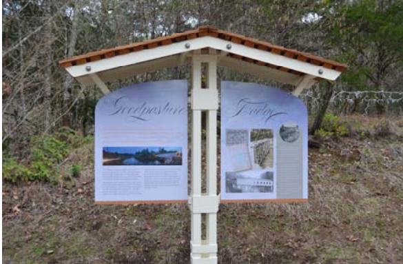
Fig. 4 Interpretive display

To complete the project, bridge lighting was installed, and an interpretive display devoted to the history of the bridge was added at the top of an existing stairway leading to the river bank at the southeast corner of the bridge.