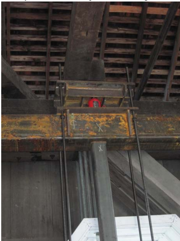
Fig. 3 Jack on temporary steel truss

This was accomplished by constructing a pair of tube-steel trusses that fit inside the covered bridge and had sufficient capacity to bear the entire weight of the covered bridge and live loads up to 133 kN. To make room for the steel trusses, 600 mm were cut from each edge of the bridge decking, the bridge rail was removed, and temporary guardrail was installed. The temporary steel trusses bore directly on the concrete piers, narrowing the roadway from 4.9 m to 3.7 m during this phase of construction.