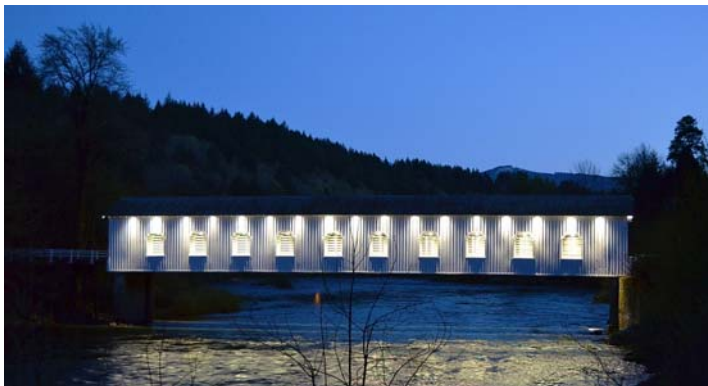
Fig. 5 LED lighting on bridge

During the past several years local residents have established a tradition of decorating the bridge for the winter holidays. Large wreaths are hung over the portals and colored lights were placed in the windows making them alternately red and green. The bridge owner (Lane County) had reservations