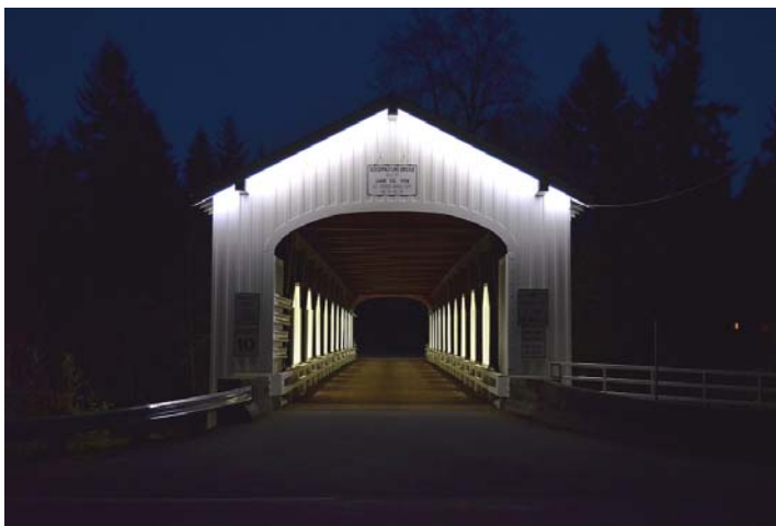
Fig. 6 Portal of bridge at night

about allowing the public to install electric lights on an old wooden structure. To satisfy residents and simultaneously relieve the County of some liability, the window lights were programmed so they can be changed from white to alternate red and green by the flip of a switch located in a locked panel concealed behind a hidden door in the wrap-around siding. The residents can still hang their wreaths and are provided access to the switch at the beginning of the holiday season. The installation is both safe and efficient.